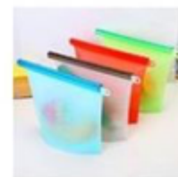
FREEZE FOOD IN SILICONE BAG