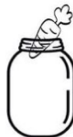
KEEP VEGETABLES FRESH