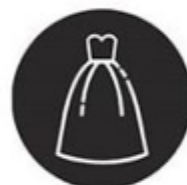
USE COTTON BAGS