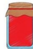
STORE IN SEAL TIGHT CONTAINERS